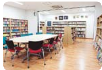
Library for Patients