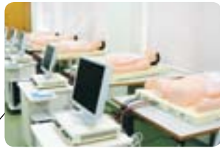
Clinical Skills Laboratories