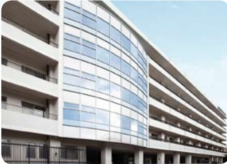
New Ward D